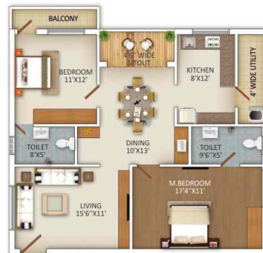
■ West Facing | 2BHK | 1382 sft.