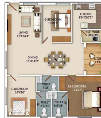
■ EAST Facing | 3BHK | 1818 sft.