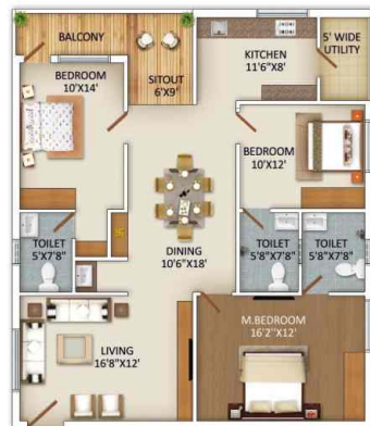
■ West Facing | 3BHK | 1818 sft.